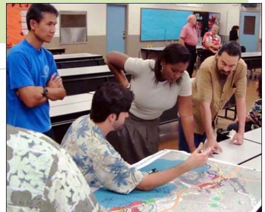
Community Workshop 1 - October 21

A community task force has also been created to advise and assist with the planning process. Its members represent various organizations and interests of the surrounding communities.